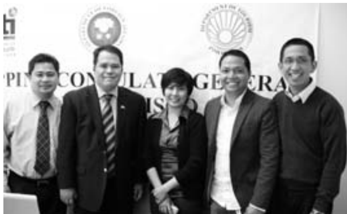
DCG Wilfredo Santos and members of the consular outreach team with young generation Filcom members in Anchorage, Alaska

A total of 326 services were rendered by the 3-man consulate team in Alaska. This includes the processing of applications for dual citizenship (82), renewal of passports and issuance of travel documents (90), legalization of documents (108), and other services (46).