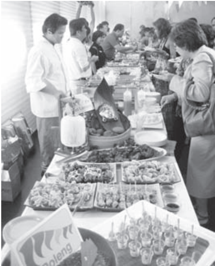
A long and scrumptious table spread of Filipino culinary offerings delighted the throng of guests at Adobo Nation's Anniversary Barrio Fiesta.

During the media launch, Cinemalaya also unveiled its new ad campaign billed Cinemalaya Cinco which was done by Black Pencil Advertising, Inc. The ad campaign celebrates the fifth year of Cinemalaya which has become a major event in local film industry. The ad campaign tags Cinemalaya as the "big, small film festival," conveying the importance and impact of Cinemalaya on Filipino independent cinema.