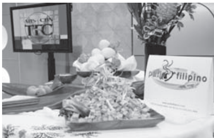
Filipino specialty cuisine was also featured in the anniversary episode of Adobo Nation.