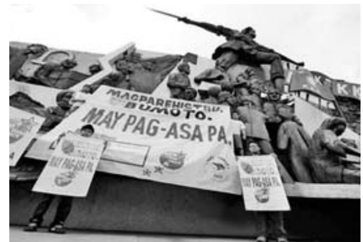
First-time voters hang a big streamer at the Bonifacio Shrine in Manila to remind everyone about the urgency of registering, with only 175 days to go before the registration deadline and 365 days left before the 2010 national elections.

"And then we will invite and encourage development NGOs, micro-enterprise programs, cooperatives and livelihood programs to start helping these