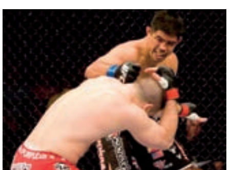
Mark Muñoz had his fighting UFC debut with veteran Matt Hamill during the undercard of the Ultimate Fighting Championship 96 in Ohio last Saturday, March 7. Muñoz lost against Hamill.