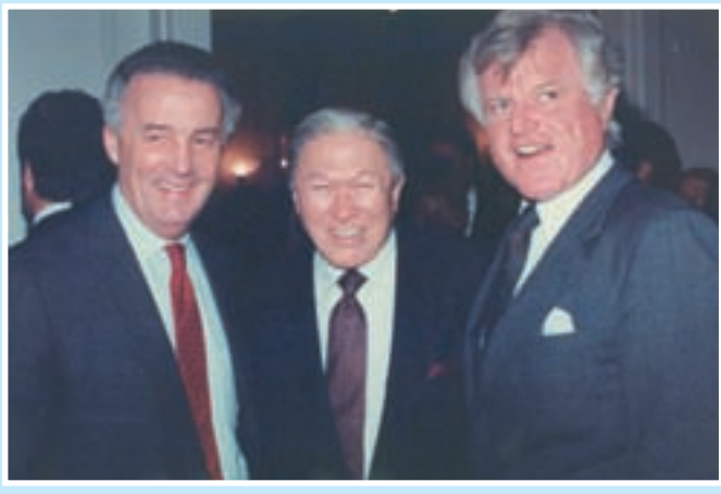
Emmanuel Pelaez with Ted Kennedy

WHEN PRESIDENT Corazon C. Aquino was invited in 1989 to the 79th birthday celebration of Diosdado P. Macapagal, Malacañang writers prepared a speech that would predictably have her extolling Macapagal at the cost of the deposed strongman Ferdinand Marcos.