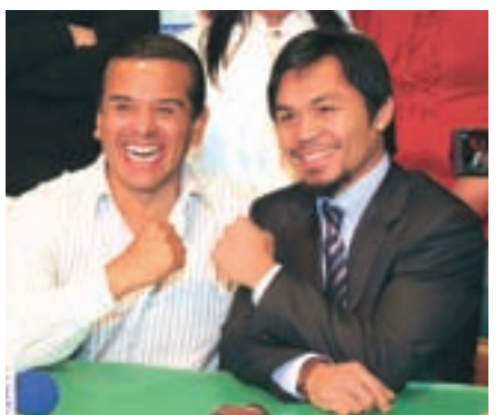
Manny Pacquiao with LA Mayor Antonio Villaraigosa

LOS ANGELES—In front of a raucous crowd, Mayor Antonio Villaraigosa honored the pound-4-pound champion Manny Pacquiao during the “Day of Service” celebration held at the Search to Involve Pilipino American (SIPA) in Historic Filipinotown last Saturday, March 7. The mayor along with Assemblymember Ted Lieu honored Pacquiao for his contributions inside and outside the boxing ring. “He’s a great champion, a great human being, an environmentalist, a man who understands that fame and celebrity comes with a responsibility to the community,” said Villaraigosa while introducing Pacquiao to the crowd. Villaraigosa then brought out a large framed certificate of appreciation, giving it to the pound-4-pound champion. “Thank you very much for inviting me here to be part of this program to plant 1 million trees in LA,” said Pacquiao. “I’m very proud to be part of this program.” The Day of Service celebration focused