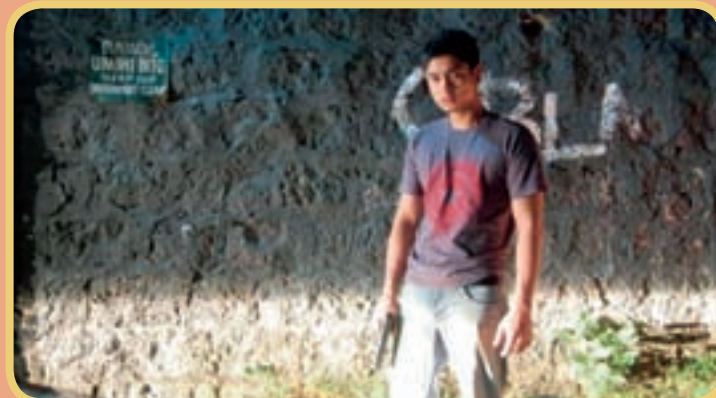
A scene from 'Kinatay' and in the Oldenburg fest in Germany this month, too.