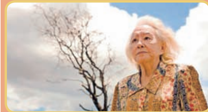
A scene from 'Adela'

The 7th Pacific-Meridian International Film Festival, to be held in