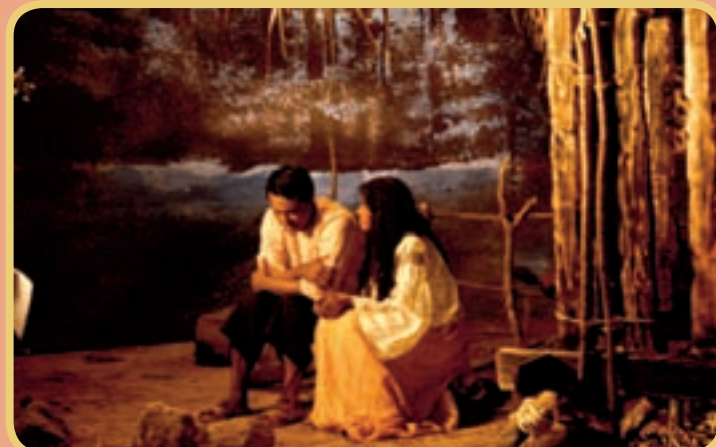
A scene from 'Independencia'