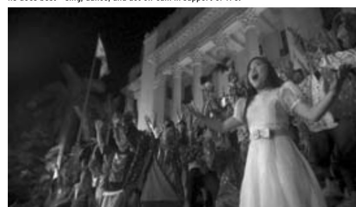
In " Dahil Tayo'y Filipino ", Charice honors the flag with a diverse assembly of personalities - symbolic of the Global Pinoys who give pride to their country.