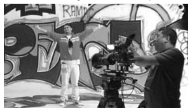
For his Kapamilya network, multi-talented international celebrity Billy Crawford does what he does best - sing, dance, and act on-cam in support of TFC.