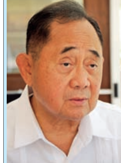
Former House Speaker Jose de Venecia, Jr. turns in a serious note when asked about the current administration in a recent exclusive interview with the Asian Journal.

MANILA—Last July 21, Pangasinan Rep. and former Speaker of the House of Representatives of the Philippines, Jose de Venecia filed a petition for the nullification of the Lakas-Kampi-CMD merger which he claims was illegal and violated the charter of the Lakas-CMD party.