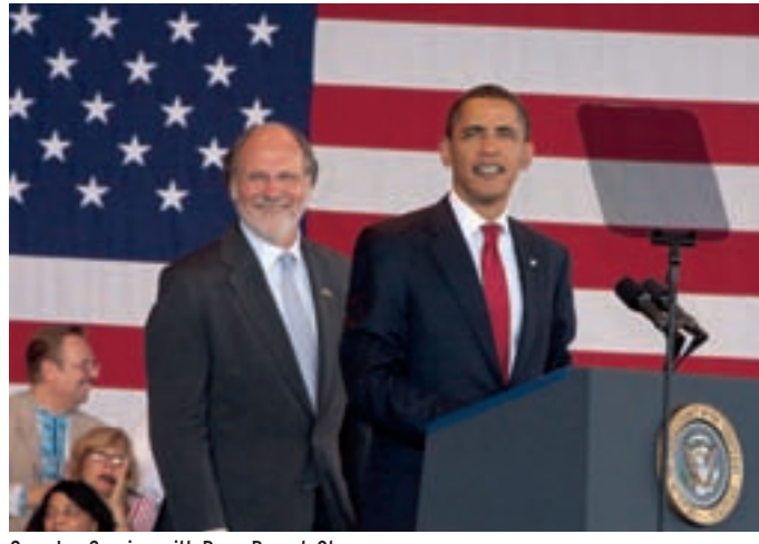
Gov. Jon Corzine with Pres. Barack Obama.

HOLMDEL, NJ—It was a hot and humid afternoon last July 16 as New Jersey Governor Jon Corzine welcomed the 17,200 supporters who were intently waiting upon the arrival of President Barack Obama. Originally scheduled at Rutgers University, the rally was moved to the PNC Bank Arts Center due to the overwhelming response. During the wait, the