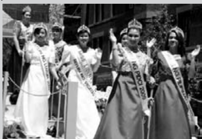
A plethora of princesses wave as they float along Madison Avenue.