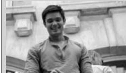
A smile from Dingdong gets the crowd pumped.