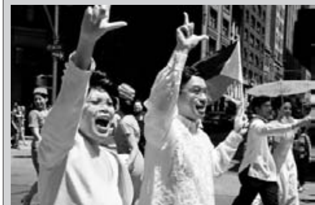
Cast of the upcoming play 'Imelda' marching at the Philippine Independence Day Parade.