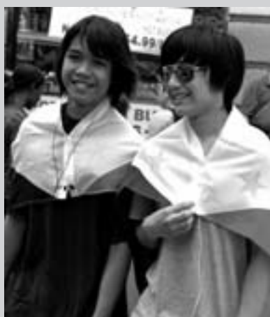
Filipino youngsters don the elegant flag of the mother land.