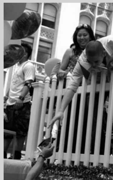
Jay-R reaches down to grab a memento from a fan abroad.