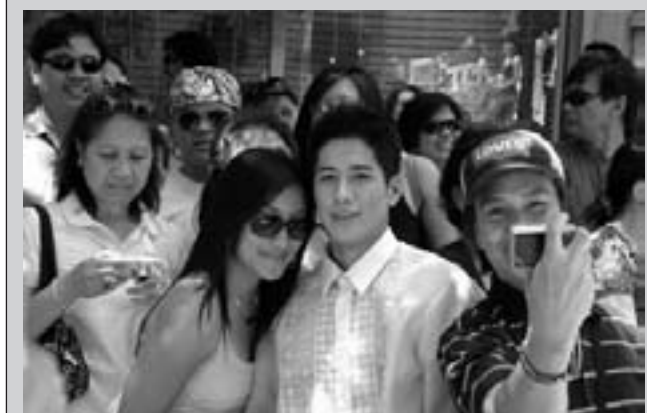
Aljur Abrenica, a telenovela star poses with adoring fans.