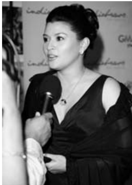
'100' star Mylene Dizon at the Indiobravo Filipino Film Festival

Two of the crowd favorites include the critically-acclaimed Centerpiece Film, Tirador (Sling-shot) by 2009 Cannes Best Direc-