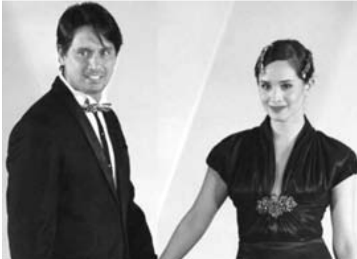
Richard Gomez and Lucy Torres

As a product endorser, Goma is much sought after. He's the original and main model for Bench, which still remains a top apparel brand to this day.