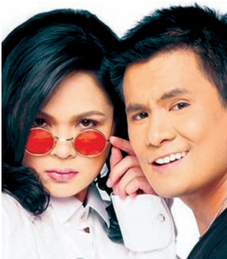
JUDY Ann Santos and Ogie Alcasid describe each other as "real, sincere."

Whenever they watch movies, she can guess where the story's headed, he adds. "She focuses on it and chides me because I have short attention span. I tell her: 'Can't we just relax and enjoy the movie?'" ■