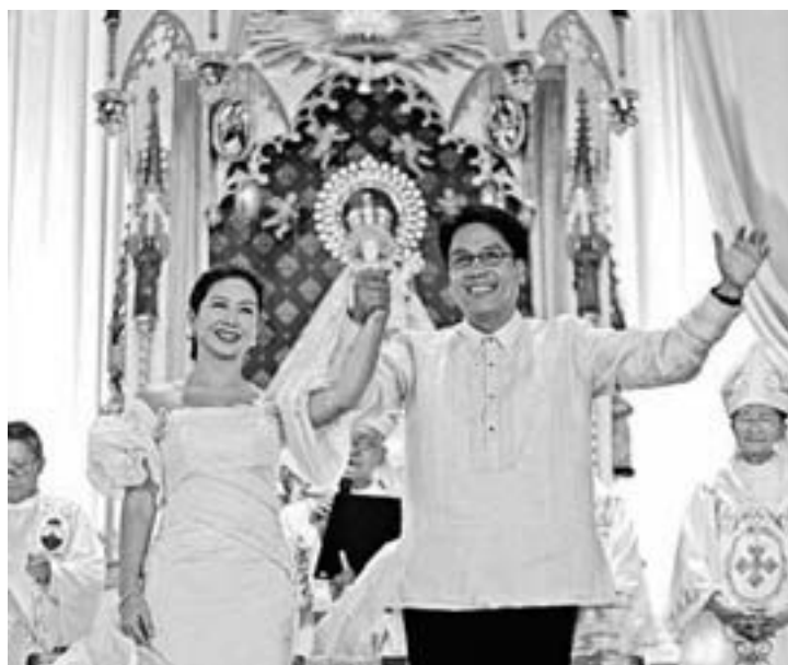
TALK OF THE TOWN. With arms raised in a victory campaign mode, bride and groom face the public for the first time as Sen. and Mrs. Mar Roxas (nee Korina Sanchez) after Tuesday's wedding rites at Santo Domingo Church.

A transcript of the couple's vows was posted in ABS-CBN News.com. "Korina, I take you as God's precious gift. I love you as you are. You are precious to me. I am happy we are together and truly thank you for taking me and putting up with me. I give myself to you