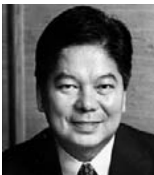
Amando M. Tetangco Jr.

"The continued growth of remittance flows since January this year accompanied by emerging