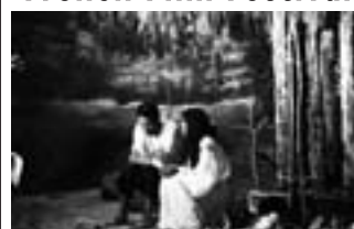
A scene from the film