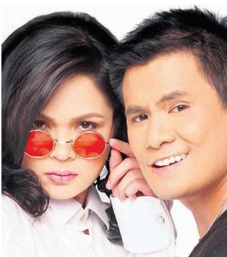
Judy Ann Santos and Ogie Alcasid

Whenever they watch movies, she can guess where the story's headed, he adds. "She focuses on it and chides me because I have short attention span. I tell her: 'Can't we just relax and enjoy the movie?'"