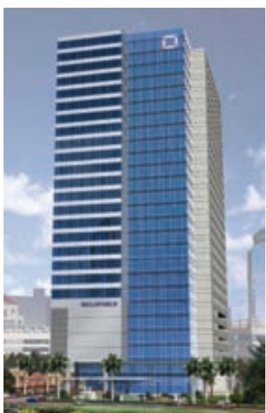
Global One Center