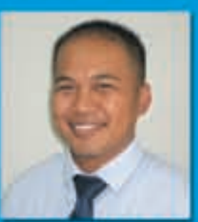
BERT WENCESLAO SALES & LEASING