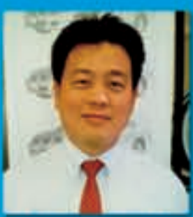
ALEX JACINTO SALES & LEASING