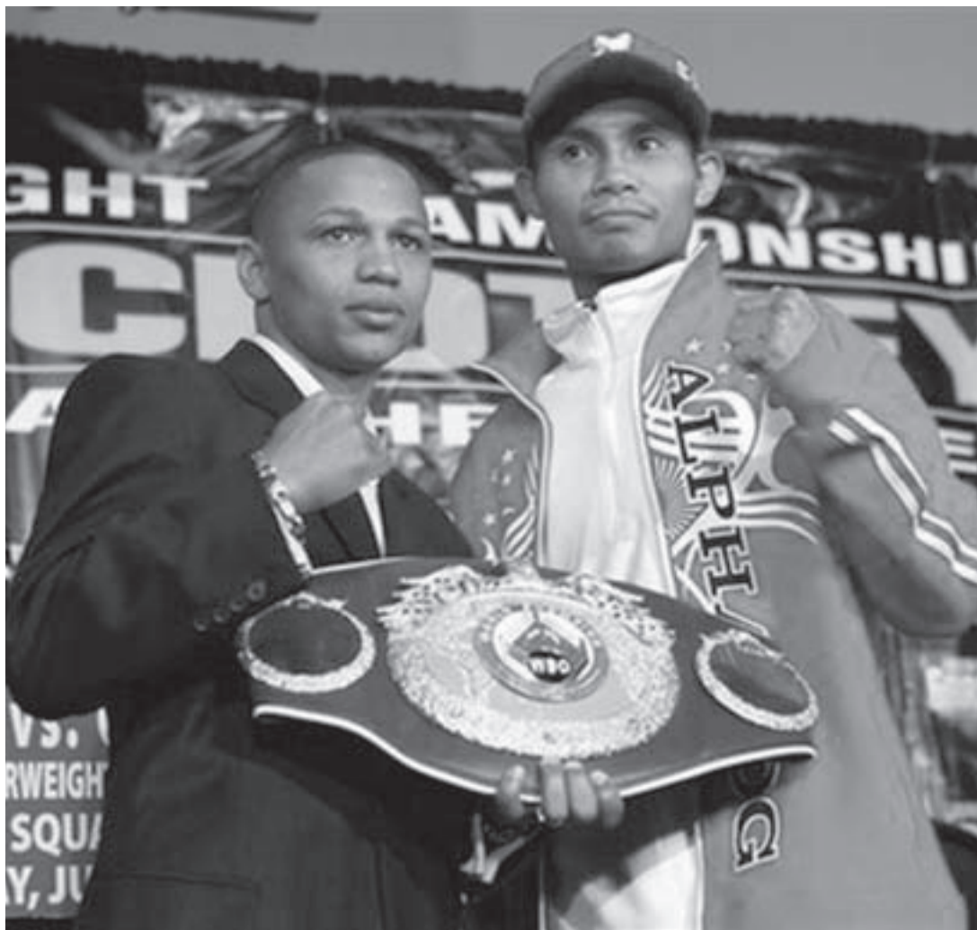
FIGHTING FOR RECOGNITION. Boxers Ivan Calderon, of Puerto Rico, left, and Rodel Mayol, of the Philippines, pose during a news conference in New York, Wednesday, June 10. Calderon and Mayol will battle for Calderon's WBO light flyweight title at Madison Square Garden in New York on June 13.