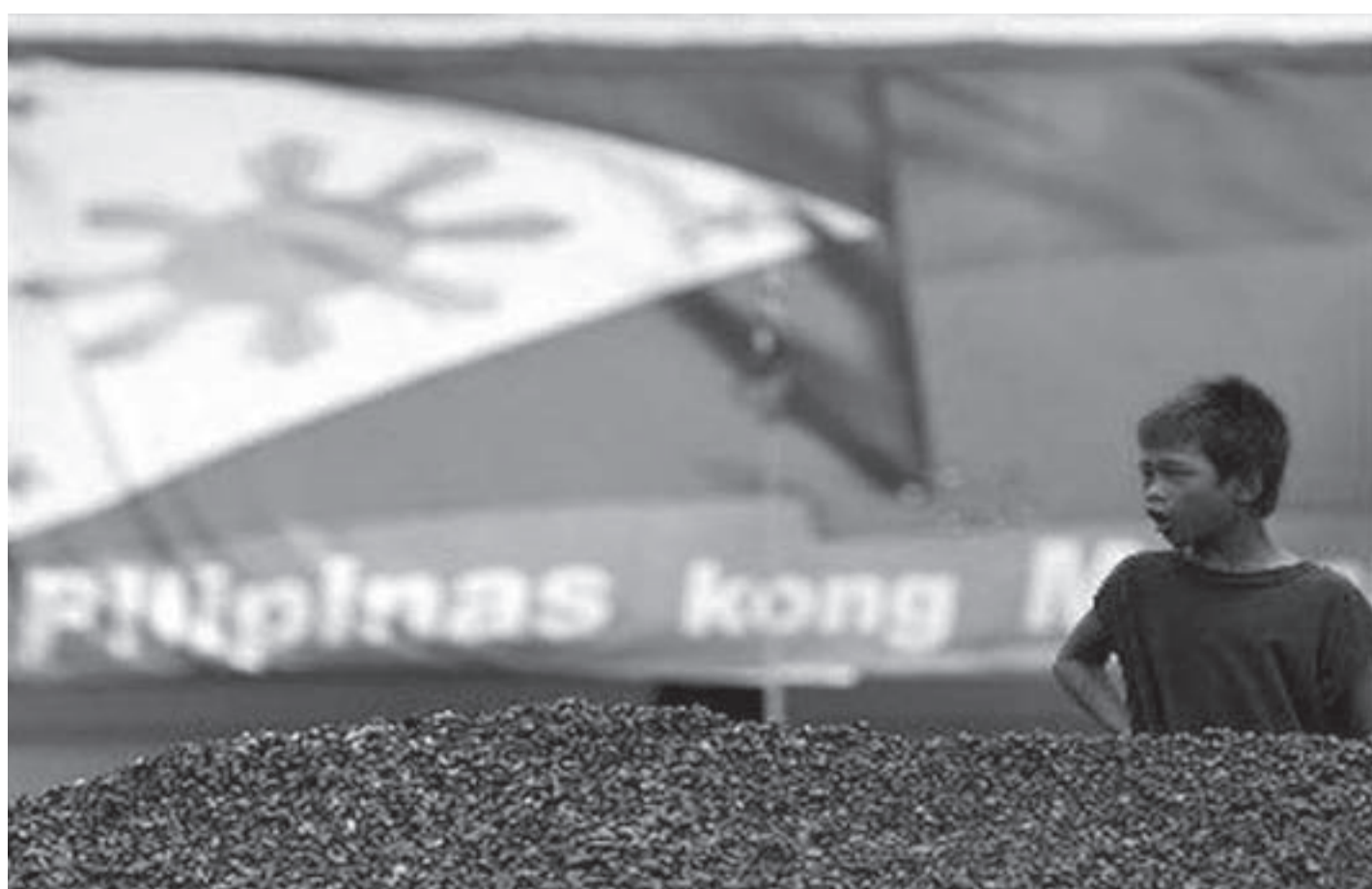
FOR WHOM FREEDOM FLIES. A boy stops to look at a billboard-sized flag at the Luneta Grandstand in Manila for Friday's celebration of Philippine Independence Day.

"The Comelec should be commended for going through the process of choosing the company that will provide the technology for our automated polls. This will take the nation a step closer to attaining every Filipino's dream of participating in a clean, honest and credible election in their lifetime," he said. (Inquirer.net)