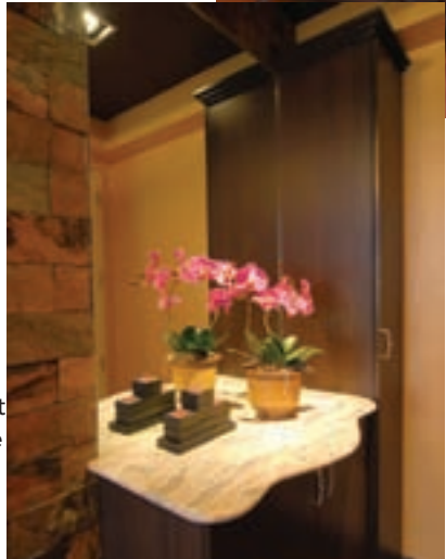
The granite wall, mirror and wooden cabinetry of the foyer immediately make one feel at home at Fil-Am Gina Santiago's Eastwood City condo unit.