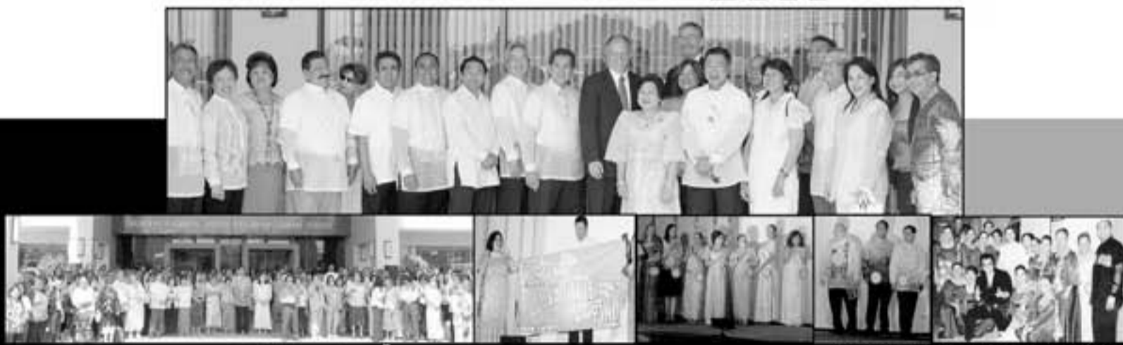
All Photos taken during HPMC Independence Day 2009