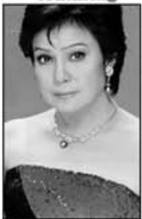
Ms. Nora Aunor