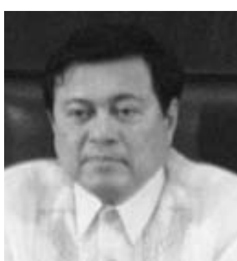
Sen. Manny Villar

“Bakit parang masamang tumanggap ng pera? Sabi ko nga, hindi labag sa batas po ang mabayaran kayo pag dumaan sa inyo ang kalye [Why is it wrong