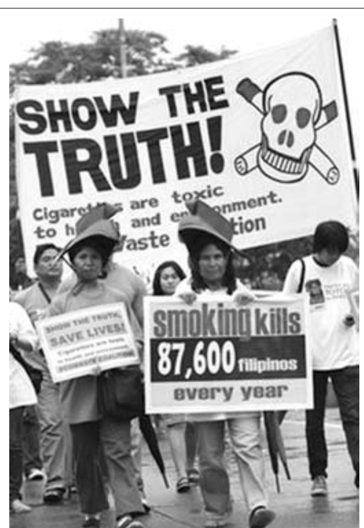
NO SMOKING. Marchers display streamers and placards showing the bad effect of smoking to our health and environment during the celebration of World No Tobacco Day on May 31, in Manila.

The nationwide survey had 1,200 respondents from all over the country. ■