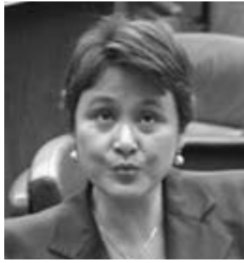
Sen. Jamby Madrigal

to accept money? Like I said, it is not against the law if you get paid by those who use your road,” he said.