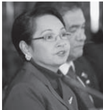
Pres. Gloria Macapagal-Arroyo

The President said the merger of the two parties was a "tangible