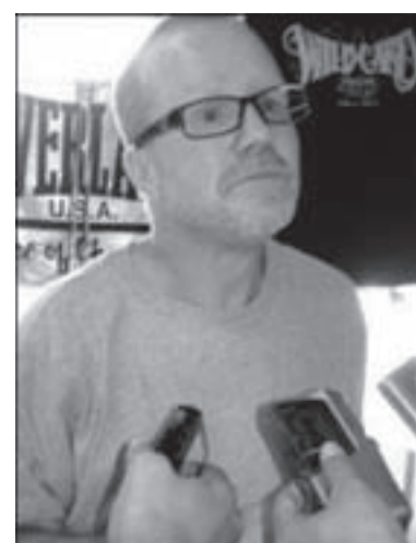
A congressman has filed a resolution to make Manny Pacquiao's trainer Freddie Roach as an honorary Filipino citizen.