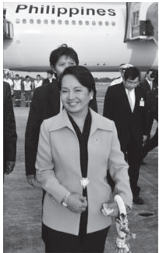
President Gloria Macapagal-Arroyo

Highlights of the two-day visit include her bilateral meeting with Syrian President Bashar Al-