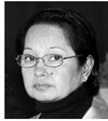
Pres. Gloria Macapagal Arroyo