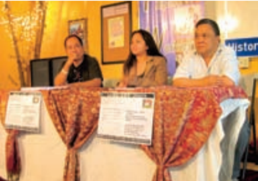
PWC press conference

LOS ANGELES—In a press conference in LA, Multi-ethnic Immigrant Workers Organizing Network and Pilipino Workers Center announced that a $13M settlement has been won in their lawsuit against the Los Angeles City government for the inhumane police actions of the LAPD against the MIWON march and rally on international workers day two years ago. All of the peaceful demonstrators that suffered from the wrongful police actions on May 1st 2007 at the MIWON march and rally will be eligible to receive compensation for the violation. Filipino participants of the said rally are enjoined to contact PWC to fill out claim forms to avail of the settlement.