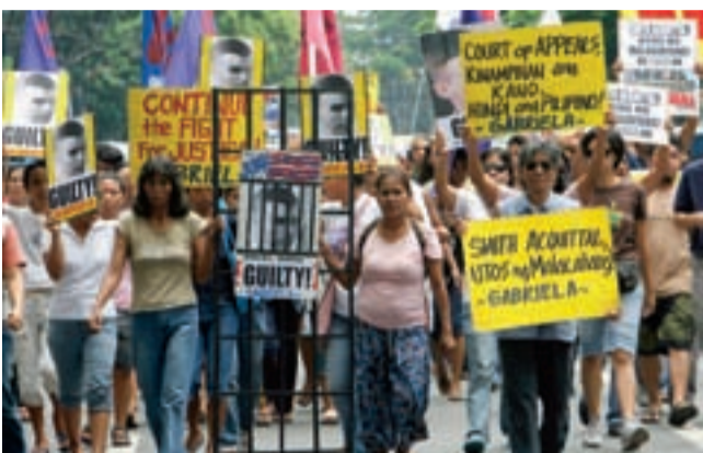
Protesters carry anti-government placards and portraits of US marine Lance Corporal Daniel Smith, while marching towards the US embassy in Manila April 24, 2009 to protest the acquittal of Smith.

M ANILA—US Marine Lance Corporal Daniel Smith left the country last April 24 after the Court of Appeals (CA) acquitted him of the crime of rape and ordered his immediate release from detention, the US Embassy said.