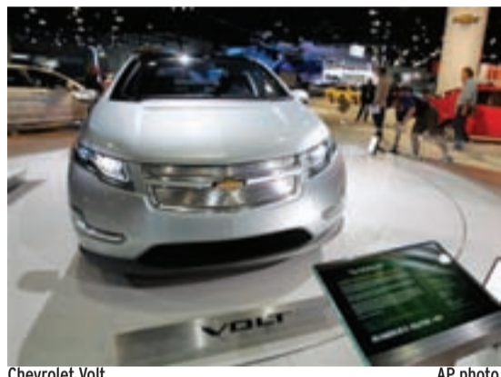
Chevrolet Volt

SEVERAL automakers are developing plug-in hybrid vehicles and electric cars that could help meet President Barack Obama's goal of putting 1 million plug-in hybrids on the road by 2015. Many industry officials say the goal is a worthy one but will be difficult to meet. A look at the work by some auto manufacturers: GENERAL MOTORS CORP.: General Motors is set to produce the Chevrolet Volt, an extended range electric plug-in, in late 2010 in limited numbers. The Volt is the centerpiece of GM's attempt to take the lead in electric vehicles and will have a lithium-ion battery and electric motor that can take the car 40 miles on a single charge. A gasoline engine will kick in to power a generator to extend the Volt's range beyond the 40 miles. GM has not yet announced the price of the car, but the cost is expected to be $30,000 to $40,000.