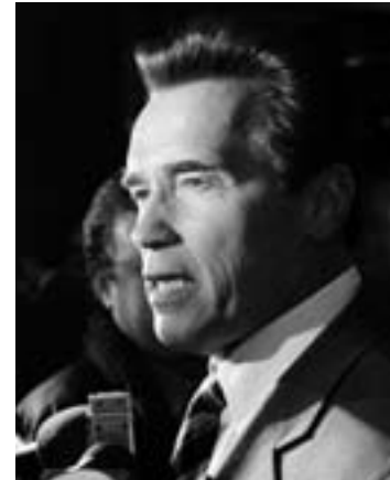
California Governor Arnold Schwarzenegger

add jobs, and still our hospitals and community clinics struggle with massive shortages because our colleges and medical training program can't keep pace with the rising demand. This public-private partnership will expand the number of pharmacists, lab technicians, imaging specialists and more—giving thousands of Californians the opportunity to pursue their dreams while making our state a healthier place to live."