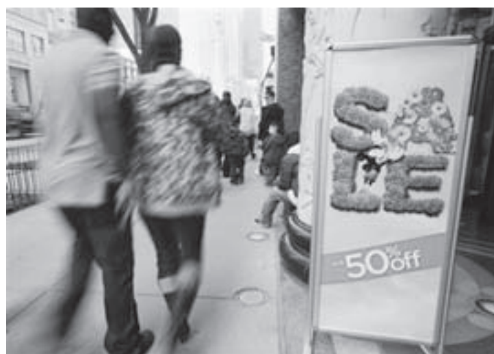
A business advertises a sale of up to 50 percent off on Chicago's Michigan Ave. Thursday, April 9, 2009, in Chicago. March same-store sales fell for the sixth straight month, as consumers continued to shop cautiously and stick mostly to necessities such as food, but there were some glimmers of stabilization in retailers' reports on Thursday.