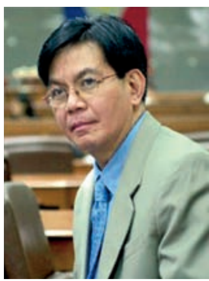
Senator Panfilo Lacson