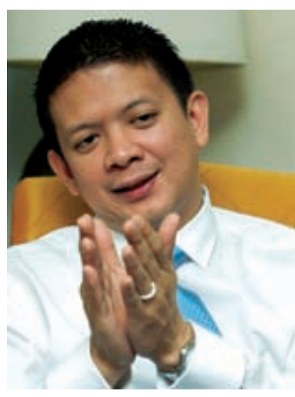
Senator Francis Escudero