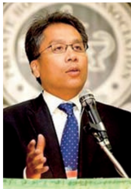
Senator Manuel Roxas II