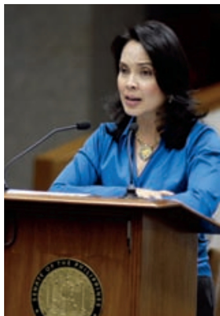
Senator Loren Legarda