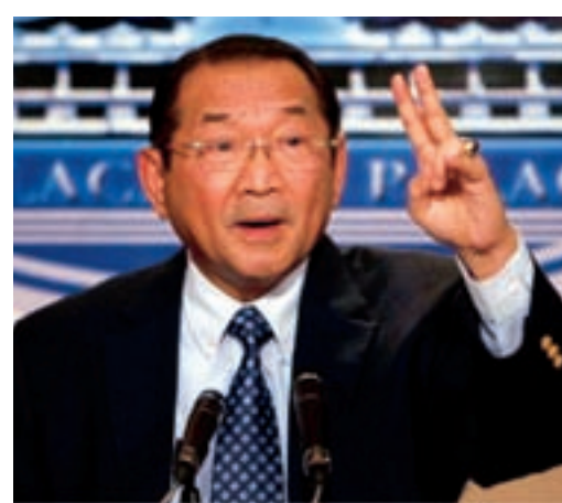
Executive Secretary Eduardo Ermita