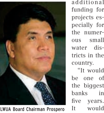
LWUA Board Chairman Prospero Pichay Jr.