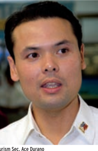
Tourism Sec. Ace Durano