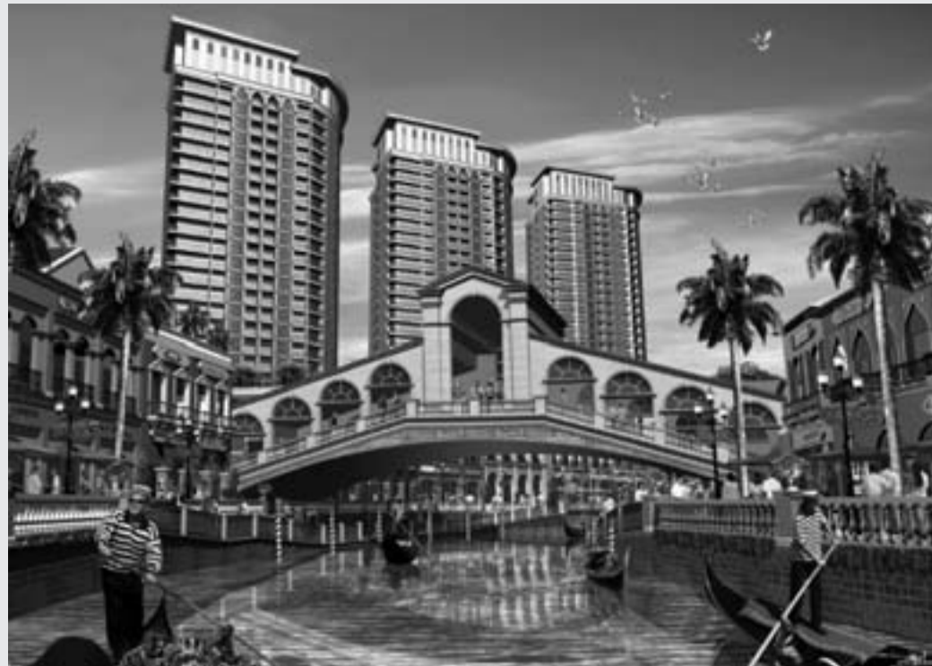
Residents of The Venice Luxury Residences can regularly take a romantic gondola ride along the Grand Canal and exchange hugs and kisses once they pass the Rialto Bridge.

P ROPERTY GIANT Megaworld Corporation recently unveiled its most beautiful and romantic project to date – The Venice Luxury Residences in McKinley Hill, Fort Bonifacio.