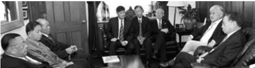
Meeting with Representative Mike Honda