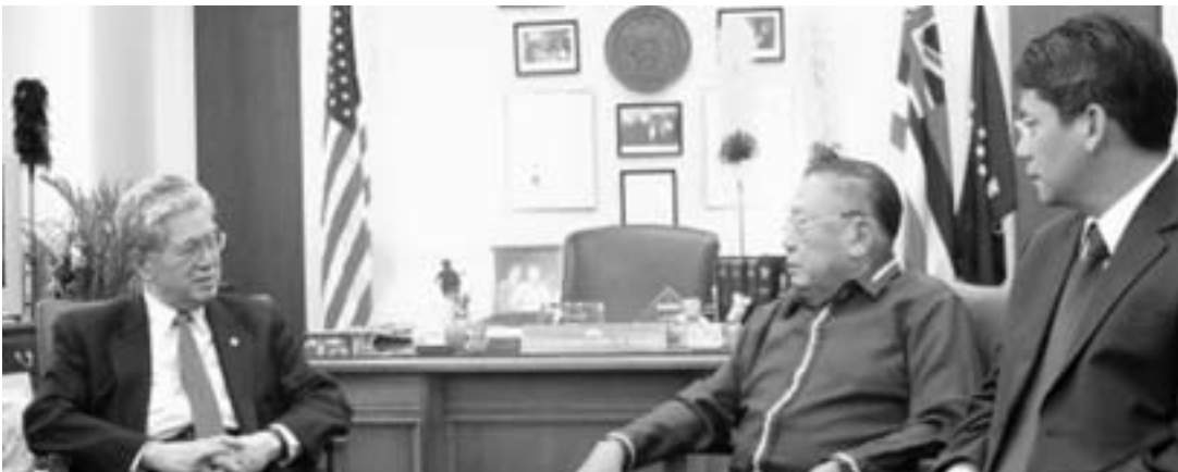
Meeting with Senator Daniel Akaka, Chair, Senate Veterans Affairs Committee