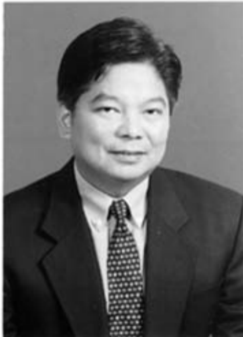
BSP Gov Amando Tetangco Jr.

A MID expectations to the contrary, the central bank, Bangko Sentral ng Pilipinas (BSP) expects balance of payments (BoP) to show a surplus this year, possibly exceeding $500 million but not more than $2 billion at end-December, BSP Governor Amando Tetangco Jr. said.