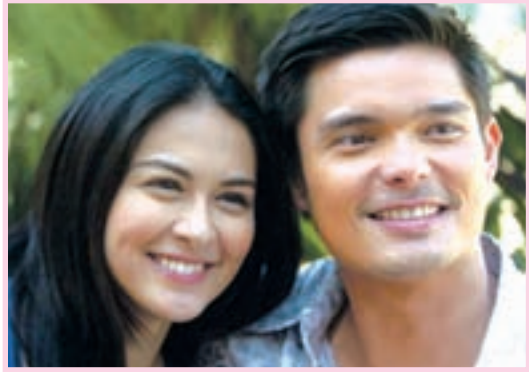
Dingdong Dantes with screen partner Marian Rivera, the rumored cause of his breakup with girlfriend Karylle.