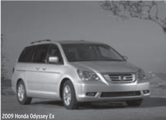
2009 Honda Odyssey Ex