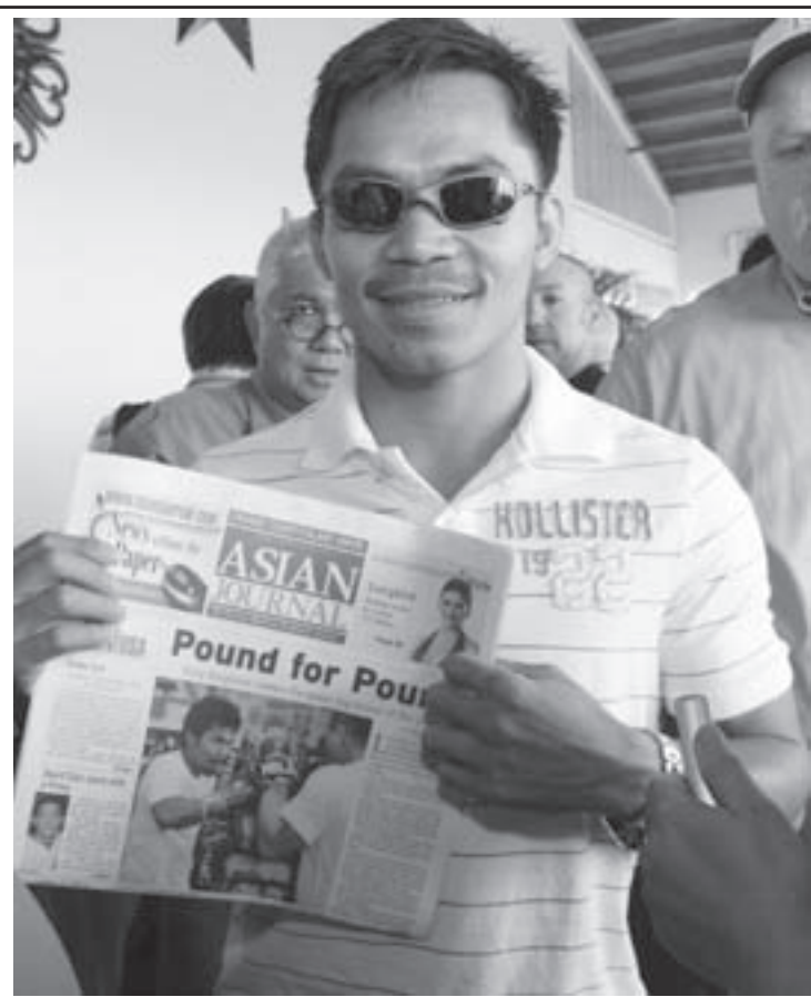
File photo shows Manny Pacquiao with a copy of The Asian Journal .

"My power is there, my speed is still there. My power, in fact, has gotten stronger. I've been sparring with bigger guys and I've been able to take their punches. I think I can