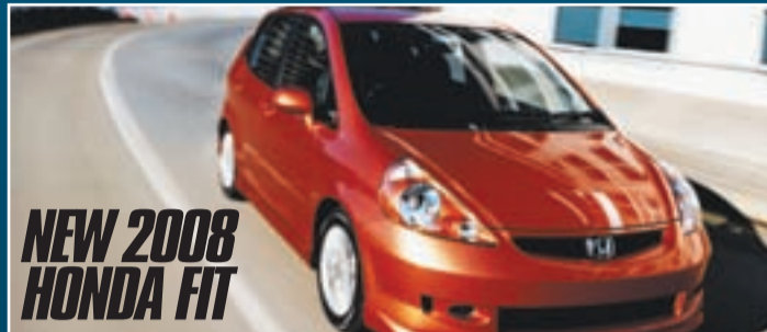
NEW 2008 HONDA FIT

3 DAY ONLY! FRIDAY OCT. 17TH SATURDAY OCT. 18TH SUNDAY OCT. 19TH