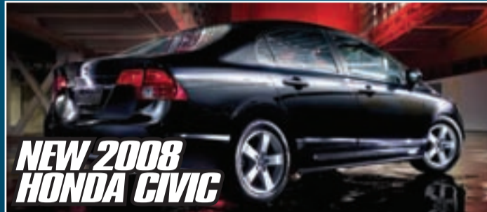
NEW 2008 HONDA CIVIC