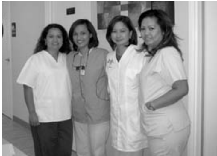
Gentle Care Dental aspires to live up to its name. Services include: bonding, bridges, crowns, fillings, oral surgery, orthodontics, porcelain veneers and whitening procedures. As part of its "Welcome, Kababayan Program" for new patients, Gentle Care Dental is giving a 10% discount for the first treatment. For patients with no health insurance, exam and X-rays cost only $30.00. Free battery-operated toothbrushes are given to new patients. This is one dental office that truly tries to put a smile on your face.

service that they offer, thereby earning valuable reputation and a slew of referrals and recommendations in the process.