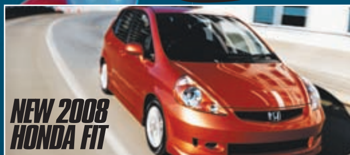
NEW 2008 HONDA FIT