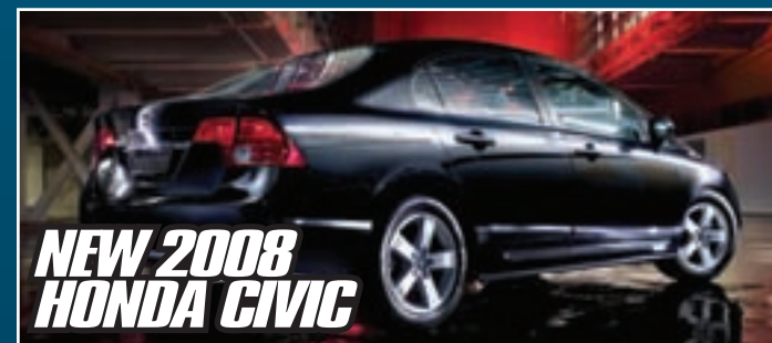
NEW 2008 HONDA CIVIC