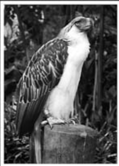
The eagle's nest was the reason environmentalists bought the island.

With the help of the World Land Trust (WLT) and the Coral Cay Conservation Ltd. (CCC) in the United Kingdom, PRRCFI Green Shares were created and sold at £25 or $40 each to pay a bridging loan from the Land Bank of the Philippines.