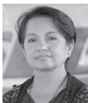
Pres. Gloria Macapagal-Arroyo constitutional amendments will go on full gear in tackling bills calling for the amendment of the Constitution.

Side-by-side with efforts to consult the public on Charter change, the House committee on